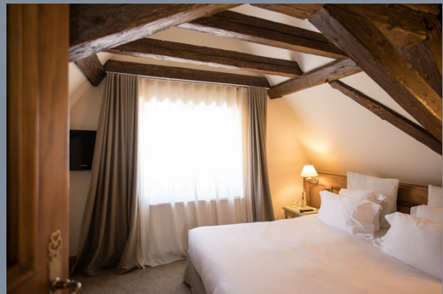
Duplex room ~34 sq/m