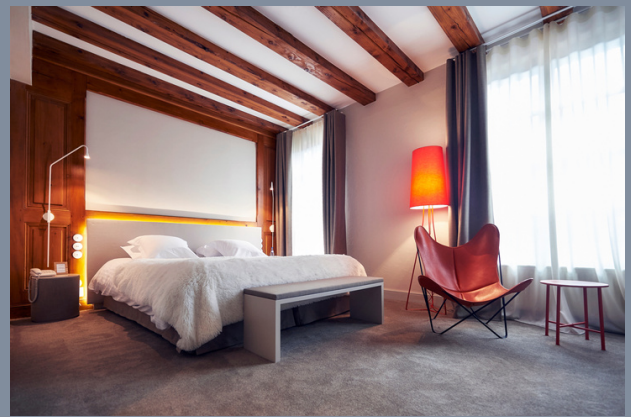
Charme rooms ~36 sq/m