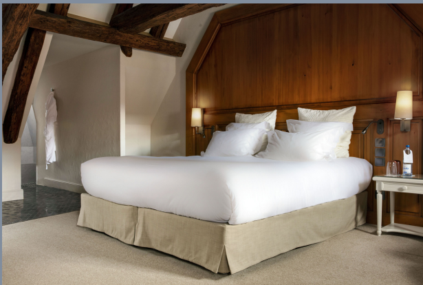
Caractère rooms ~42 sq/m