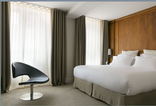
Confort rooms ~28 sq/m